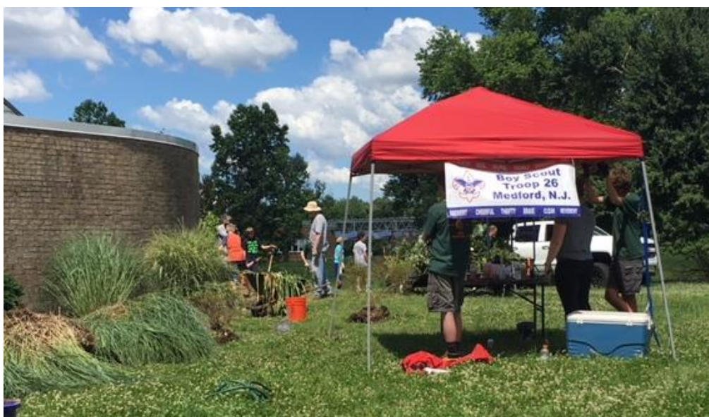
The Eagle Scout project on the north side of church!

Panera Bread Pickup: Dave Wood (backup to Kunkle and Piech)