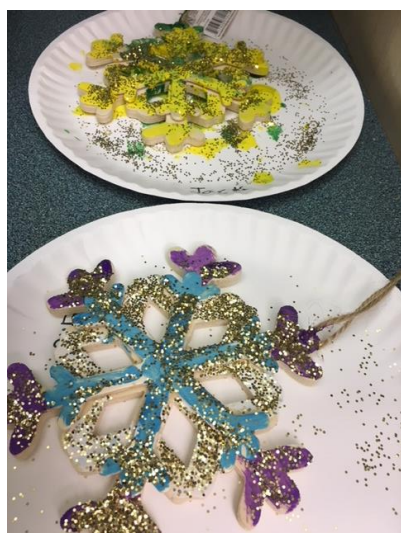
Adorable Sunday School Ornaments!