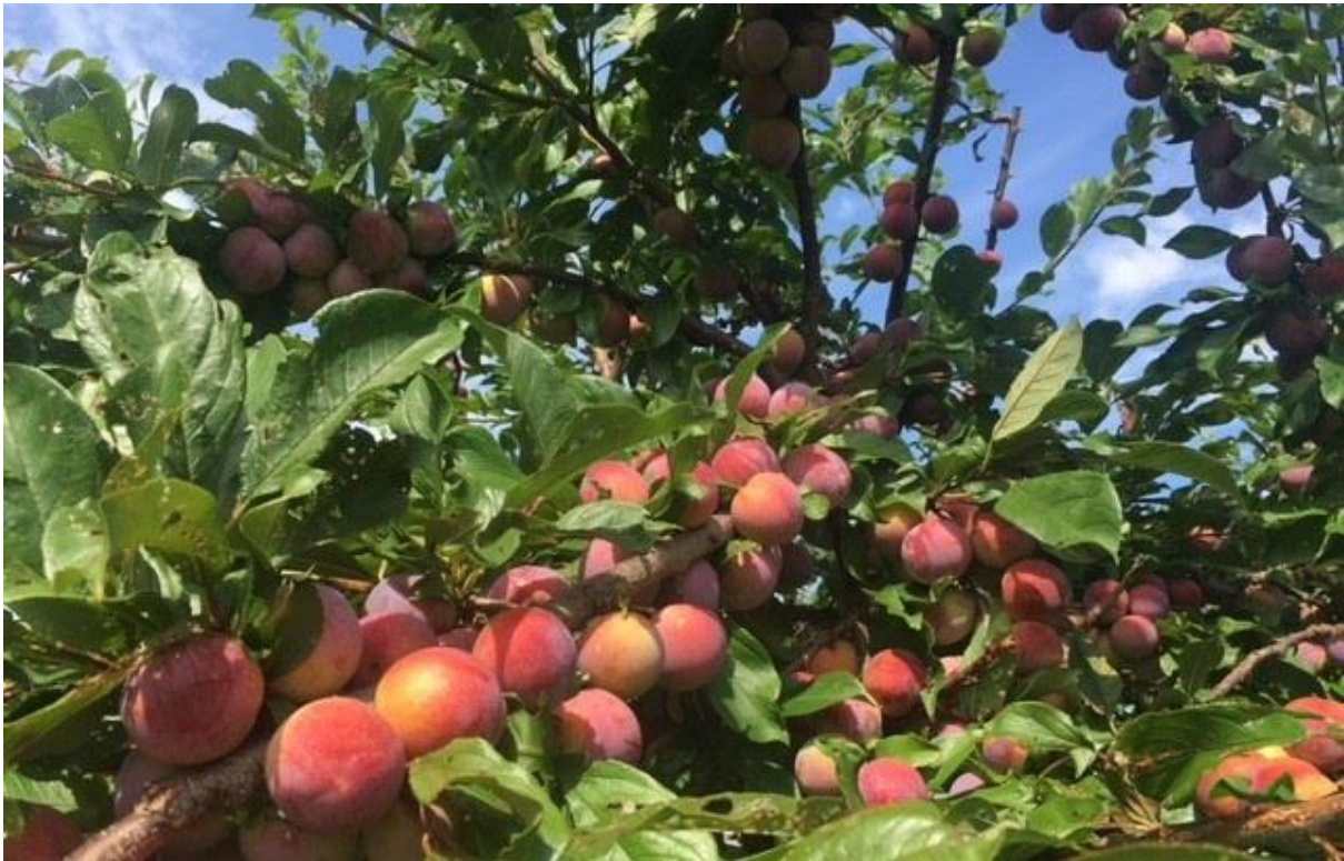
A beautiful photo of the plums growing in the HOPE Garden. Thanks, Sandy G!