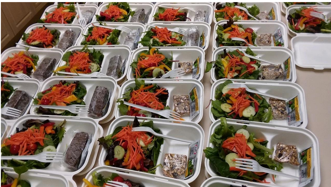
Salads with dressing, fork and protein bars. Did you know our containers and forks are biodegradable? They're made from sugar cane.