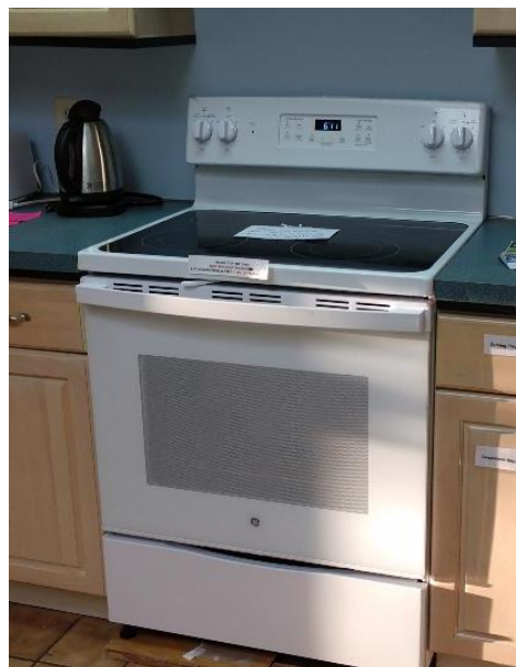
And in with the new!