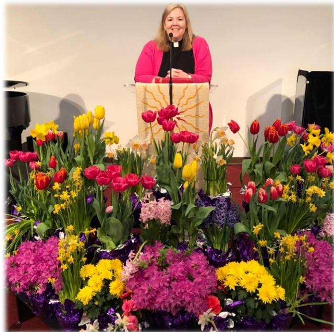
A beautiful display for Easter!

*Did you know we are now serving Gluten Free bread at Communion?