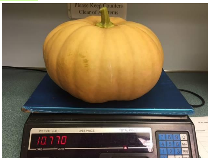
More raised beds and a huge pumpkin!