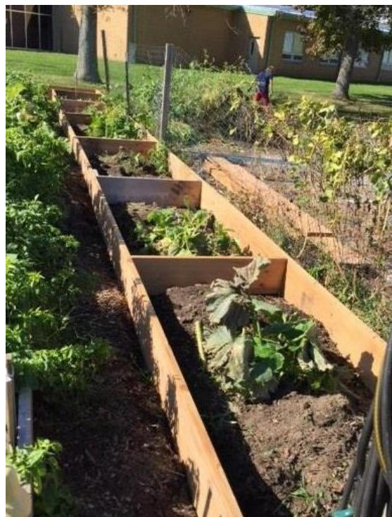
New raised beds!

One final work day is scheduled for Saturday, November 11 at 10:00 am to remove old plants, spread compost, transfer soil, and repair fencing. Please come out to help if you are able!