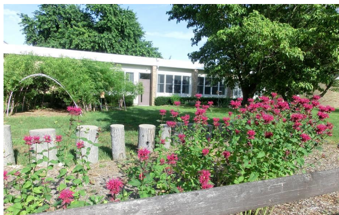
July in the Children's Garden

The committee would like to thank you for your prayers as we work to determine God's will regarding the next Pastor for Faith Church. We have deliberated more than 90 applications. At the present time, we are continuing the conversation with two applicants through phone, Skype and in-person interviews. The next step in the process, should the committee be led to do so, would be to hear each applicant in a neutral pulpit. We ask for your continued prayers for the committee and for God's blessing on the process and our conversations.